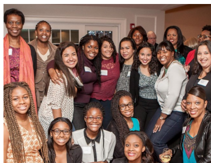
GABC Alumnae Join Scholars for 40th Anniversary Celebration in 2014