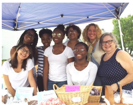
HITW and ABC Scholars conduct bake sale at Guilford Citizens Day Parade

Hole in the Wall, Guilford's oldest and only not-for-profit consignment and re-sale shop, operates solely for the benefit of Guilford's ABC program.