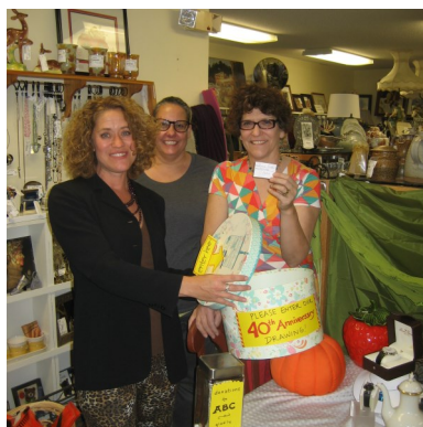
Celebrating HITW 40th Anniversary

A volunteer appreciation party was held on Sunday morning, April 27th at the shop before business hours began. All volunteers and board members were welcomed for good food, lively conversation and some surprise thank you gifts for the wonderful staffers. Hole in the Wall, where new merchandise arrives every day, is open seven days a week: Monday through Friday, 10 am to 5pm; Saturday, 10 am to 4 pm; Sunday, noon to 4 pm.